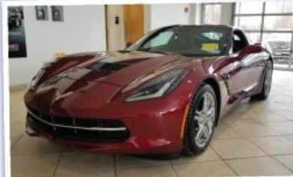
USED 2017 STINGRAY COUPE 2LT

Additional Options: GS 3LT preferred equipment group; carbon flash painted ground effects package; carbon flash hood stinger stripe; removable roof panel—visible carbon fiber with body-color surround; carbon fiber wheel center caps with crossed flags logo; Grand Sport black painted aluminum wheels