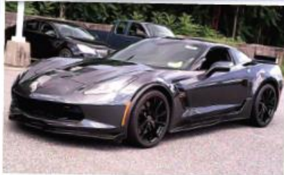
NEW 2018 GRAND SPORT COUPE 3LT

Additional Options: 2LZ preferred equipment group; visible carbon fiber ground effects package; exposed carbon fiber spoiler; removable, visible carbon fiber roof panel with body-color surround; exposed carbon fiber weave hood insert; performance data and video recorder; Z06 black aluminum wheels