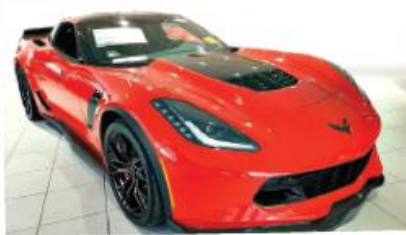
NEW 2017 Z06 2LZ COUPE

CLUB MEMBERS: Buy your next new or used Corvette at Balise Chevrolet and we'll donate $500 to the Corvette Club of Western Massachusetts!