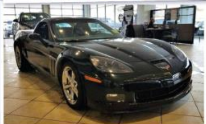
USED 2011 GRAND SPORT COUPE 2LT